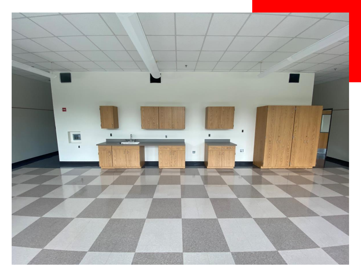
Family Living Center Casework Installed