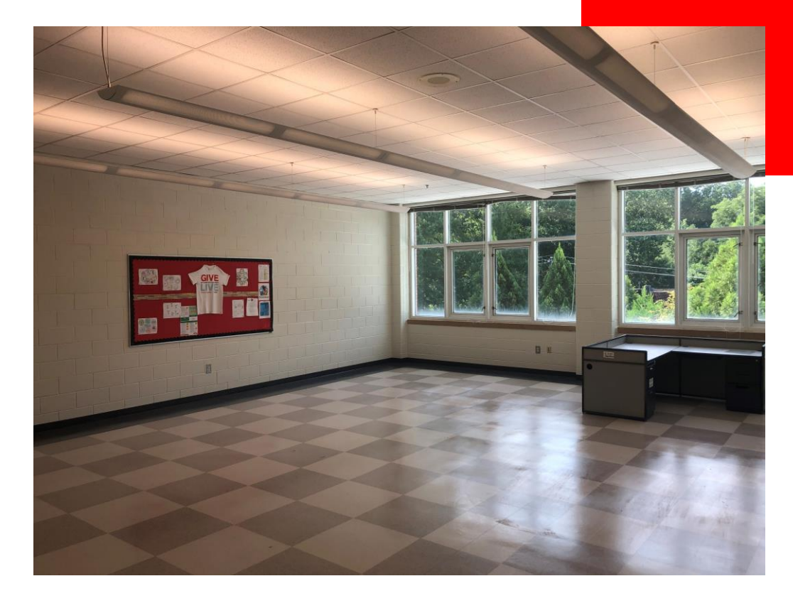
Classrooms cleaned, ceiling tiles reinstalled, and ready for furniture in the 8<sup>th</sup> Street Building