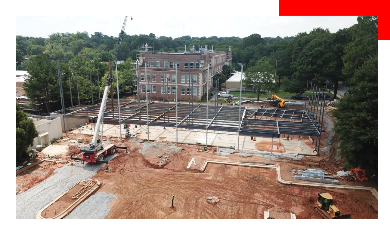
New Addition Progress